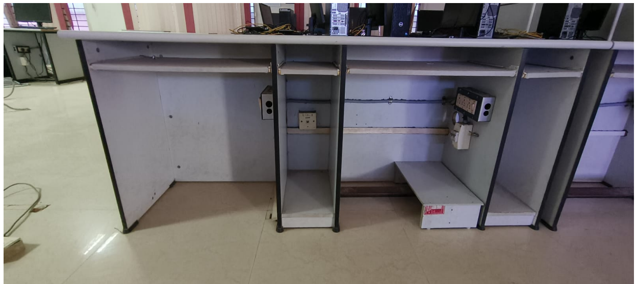
Computer Table (180x60x75)

*For references images are attached below: