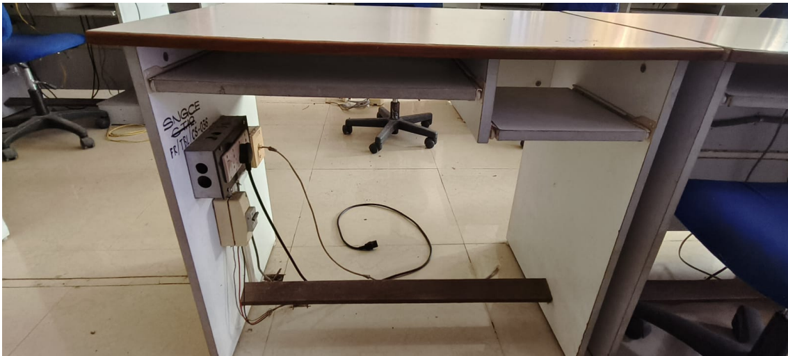
Computer Table (90x60x75)

Note : Suppliers requested to visit SNGCE for further clarification if any