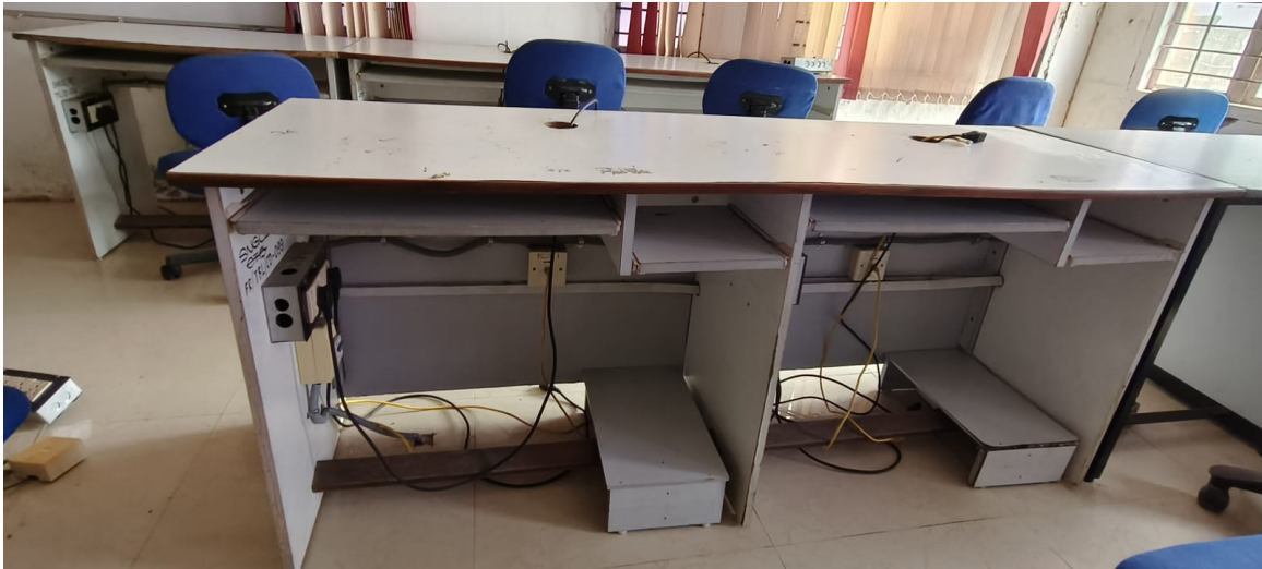
Computer Table (150x60x75)